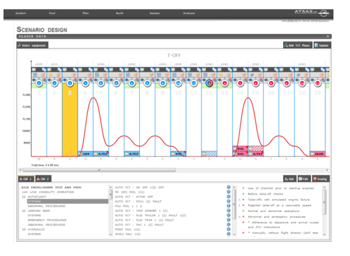
Building a training scenario

The product suite comprises dedicated safety and quality modules but can also integrate with existing systems to identify gaps in proficiency.